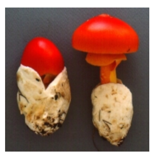
Fig. 2. Amanita jacksonii as collected in northcentral New York state. Note the unusual situation of the felted extension of the limbus in ternus of the universal veil being drawn up the stipe on the edge of the annulus on the larger basidiocarp.

Colors. Colors can be expressed in your own terms, but it will be much easier to communicate about them if a color book is used—such as the ones published by Methuen (Kornerup & Wanscher, 1978) and Munsell. The set of soil colors published by Munsell (1975) is a good supplement (largely browns and grays) to the wide color range in Methuen. Since Ridgway (1912) colors can be translated into the