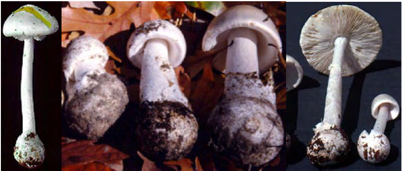
Fig. 1. Amanita bisporigera . In New Jersey, this is probably the most common cause of amatoxin poisoning. The mushroom commonly occurs in forests and with trees in yards (especially oaks and conifers). Perhaps, the white color and frequent occurrence of the mushroom in groups calls attention to it. As it ages, it develops a distinct odor suggesting carrion; this may be why dogs may occasionally attempt to eat it. A drop of 5-10% KOH solution on the cap will produce a dramatic yellow color. While this is NOT a test for a toxin, this test ONLY works on Amanita bisporigera and some other white “destroying angels.” A small dropper bottle of 5-10% KOH solution and a mobile phone camera can rapidly convey important information on a potentially deadly toxin to NJPIES who can have an identification confirmed quickly by a mycologist. Nevertheless, the most important questions to ask in all cases of suspected mushroom poisoning are ALWAYS: “When was it eaten?” “When did symptoms begin?”