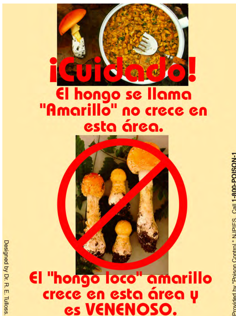
Fig. 7. Poster created after the a case of mushroom poisoning in a recent immigrant from Mexico caused by the yellow color variant of Amanita muscaria subsp. flavivolvata (el hongo loco amarillo) when it was mistaken for A. basii (el amarillo).

It should not be presumed that the biochemistry is identical in all cases in the following annotated list. In fact, with regard to mushrooms causing a gastrointestinal syndrome, the literature commonly states that while some possibly toxic compounds may have been found in some mushrooms of a given group, the knowledge is very incomplete; and the known compound(s) may not be the cause(s) of rapidly appearing gastrointestinal distress. Experiments on animals often involve injecting massive doses of a purified chemical. The human stomach and the human habit of cooking food produce a very different method of intake of mushroom chemicals, as Benjamin points out; so there seems no reason to be surprised that injections that kill mice do not always correlate to poisoning of humans who eat mushrooms containing the injected chemical.