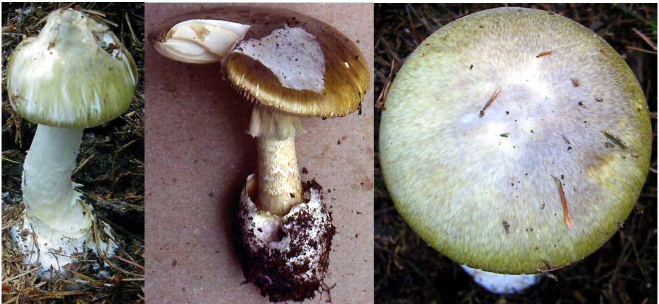
Fig. 2. Amanita phalloides . This species is the most common cause of death by mushroom poisoning in the areas where it occurs. It grows naturally in Europe and western Asia, but has been accidentally exported to both coasts of the U.S. and to many other countries on the roots of trees such as pines, oaks, some stock of nut orchards. It has been introduced in our region of interest in multiple locations, often in pine plantations established at about the time of the Great Depression. In our region, this species has not spread into native forest as it has on the U.S. Pacific Coast, where it is a significant public health hazard and possibly a hazard to the oak trees that it seems to prefer there.

The white species of this group are collectively called “Destroying Angels” in English. Amanita phalloides is commonly called the “Death Cap.”