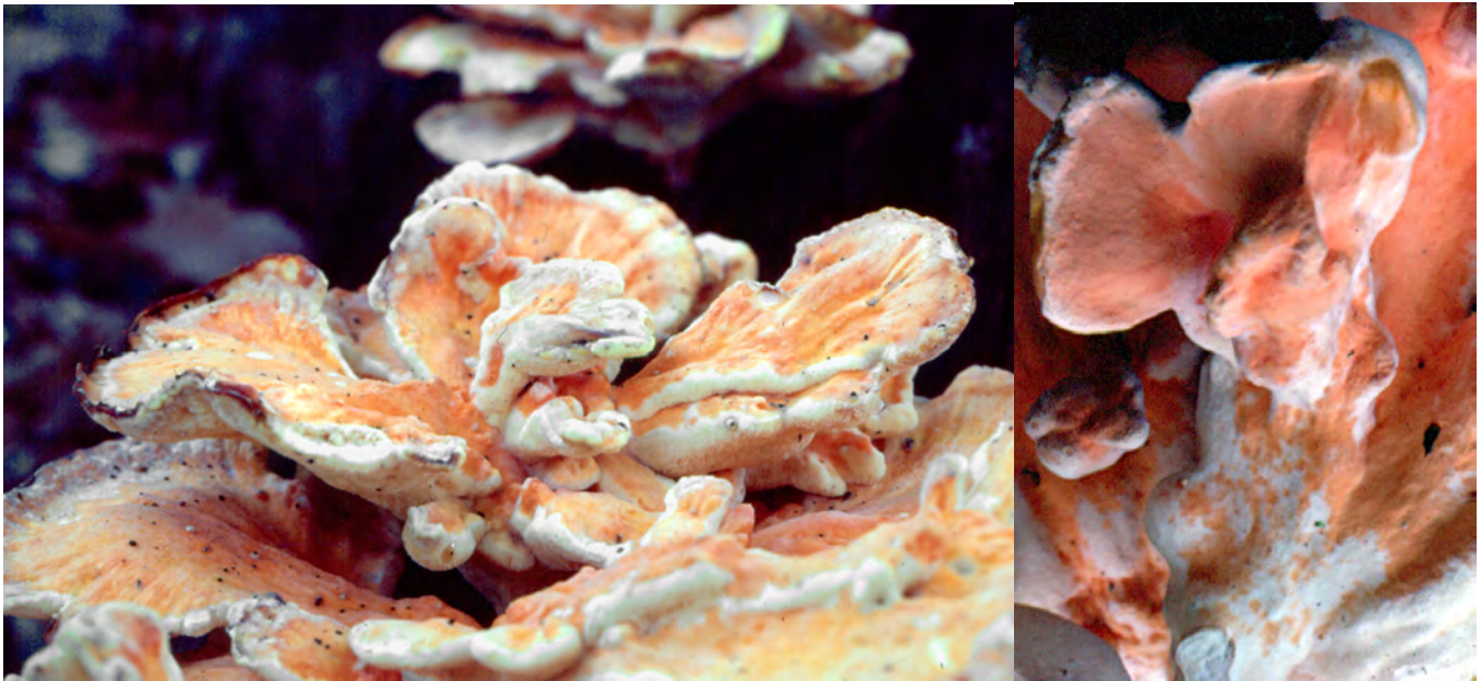
Fig. 10. Laetiporus . In our region of interest, the two most commonly collected species are considered edible. One of these has a white pore surface on the underside of its somewhat petal-like segments ( L. cincinnatus , left) and grows on the ground. The younger, parts of the fruiting body have a texture very much like that of white breast meat of chicken.

There are five species of Laetiporus in the U.S., some possibly unnamed as yet (Banik et al., 1998). The one that has been eaten the most frequently is the brilliant orange and yellow shelf-fungus, L. sulfureus .