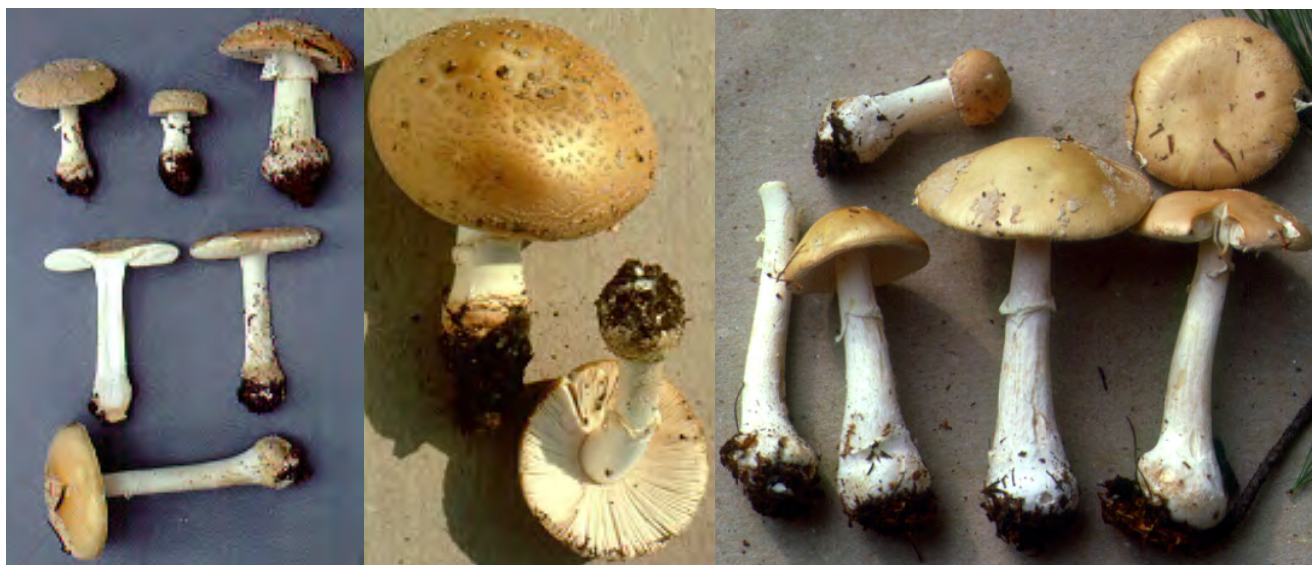
Fig. 6. Amanita crenulata . Ingestion can cause severe cases of the Pantherine syndrome. The small skirt-like ring on the stem often disappears. In fresh material, the top of the bulb on the base of the stem may have a thin coating of pale tannish powder as can be seen in the image on the left. Dry weather and a day's exposure to sun and air can produce changes in color and appearance.

of A. muscaria subsp. flavivolvata from the case of a puppy's poisoning in Pennsylvania. Marilyn Shaw (pers. corresp.) reported a case of a dog that, when out of doors and off the leash would rush to find A. muscaria subsp. flavivolvata and gobble the material down with the usual results; the behavior was only prevented by muzzling the dog. Wild animals also ingest this mushroom; RET has seen Gray Squirrels gathering mouthful after mouthful presumably for subsequent ingestion.