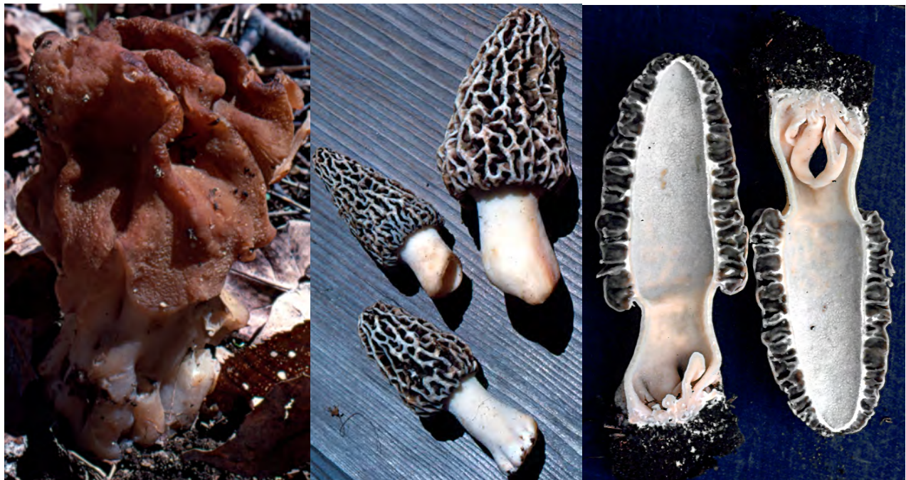
Fig. 3. Gyromitra and Morchella . Species of Gyromitra (left) often have a convoluted exterior appearance and are not entirely hollow. Species of Morchella (center and right) often have a honey-comb-like exterior appearance and are entirely hollow.

The toxin known as gyromitrin becomes monomethylhydrazine (rocket fuel!) in the human body. It is volatile, and people have been known to be poisoned by it because they removed the lid from a cooking pot of false morels (in the genus Gyromitra ) and sniffed the vapors. Dogs have been killed by eating leftovers, when the humans who ate the original meal were not noticeably affected by the toxin. The human body,