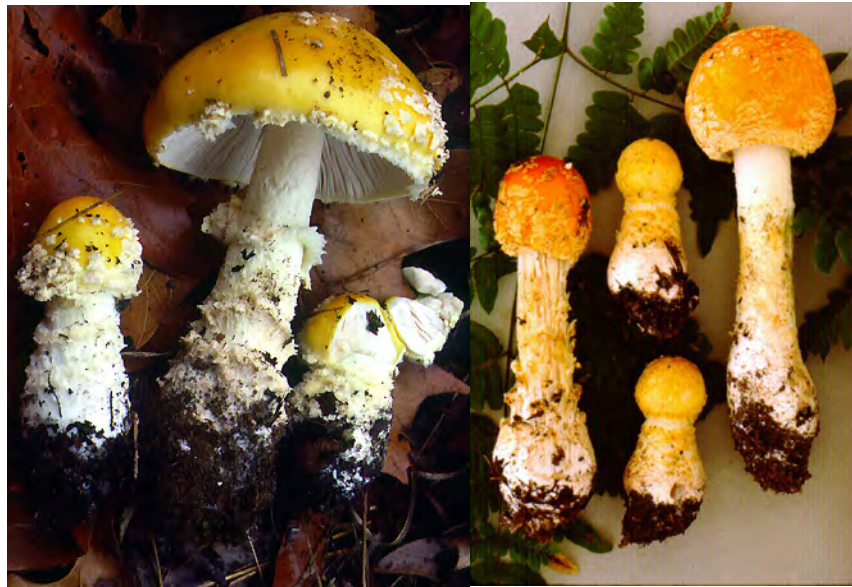
Fig. 5. Yellow color variant of Amanita muscaria subsp. flavivolvata . Ingestion can cause severe cases of the Pantherine Syndrome. Commonly occurring with conifers in the fall, but may occur throughout the mushroom season (approximately May to November to New Jersey).

to death in an adult male. The Euro-asian A. muscaria is used by shamans who say that it is deadly if more than 13 dried fruiting bodies are eaten. (Wasson, 1968).