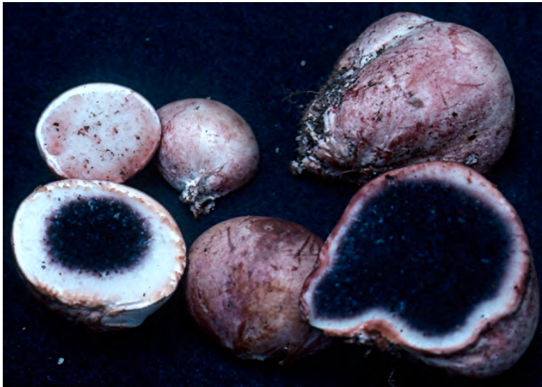
Fig. 13. Scleroderma cepa . The fruiting body is small enough that a child may place an entire specimen in her mouth. The cross-sections show the thickened skin typical of Scleroderma and the typical maturing of the whitish interior to deep purple as spores develop within the puffball.