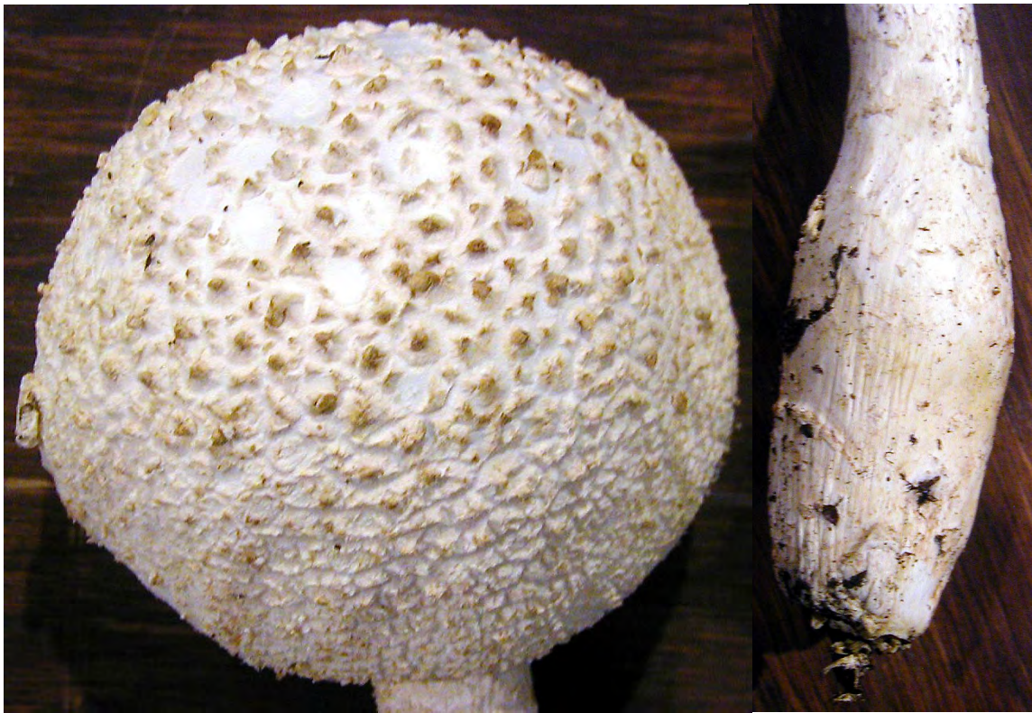
Fig. 4. Amanita rhopalopus . This species occurs in eastern North America. It is suspected of containing allenic norleucine because of its apparent, close relationship to A. smithiana . The top of the cap bears powdery remains of the mushroom's volva. The base of the stem ranges from a sausage-like shape (often tilted to one side in comparison with the vertical stem) to a top-like shape.