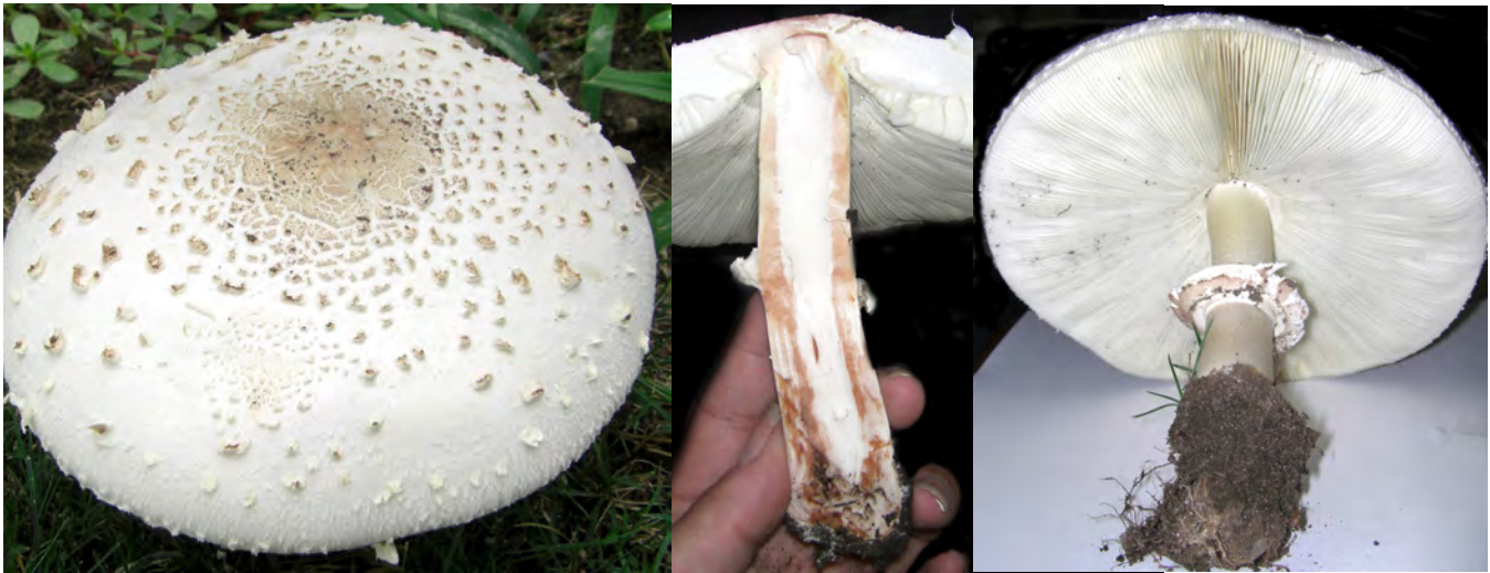
Fig. 8. Chlorophyllum molybdites . This mushroom is the most common cause of calls to NJPIES in which a person thought to have ingested mushrooms is symptomatic at the time of the call. Notice the ring around the stipe in the larger mushroom. If a cut is made across the stem, oxidation reactions cause color changes that begin with yellow or orange and progress to brown. When spores have formed on the gills, the gills are noticeably “dirty green.” A spore deposit will be the same color. Obtaining a spore deposit before ingesting wild mushrooms would save a number of people per year a very unpleasant episode. Gills in older specimens may become a greenish dark gray.

Most distinctively, the spore print of the species is “olive green”; and, in mature specimens, the gills take on a strong “dirty green” tint.