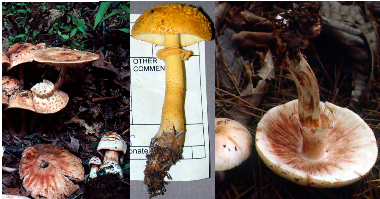
Fig. 9. Some eastern North American reddish-bruising species of Amanita section Validae . These taxa are among those that contain a hemolytic compound that causes the Gastrointestinal syndrome when eaten raw. Cooking destroys this compound. The [as yet to be named] species commonly called “ Amanita rubescens ” in our area of interest is depicted on the left. The central picture depicts A. flavorubens , and the rightmost image depicts A. rubescens var. alba .

The gastrointestinal symptoms produced by such taxa as Amanita flavorubens , Amanita rubescens (in the sense of eastern North American authors), Amanita rubescens var. alba , and related taxa are thought to be produced by a hemolytic compound that is destroyed by cooking.