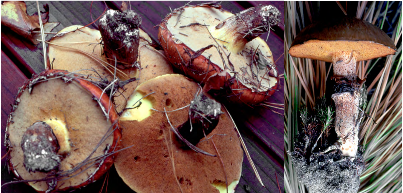
Fig. 12. Slimy topped species of Suillus . Poisoning problems with such species of Suillus appear to be related to failure to remove the slimy skin. On the left is Suillus luteus , and on the right is Suillus salmonicolor which is particularly common in the New Jersey Pine Barrens.

Note: Frequency of poisoning unknown in region of interest. The genus occurs commonly in the region of interest and is collected for food in this area.