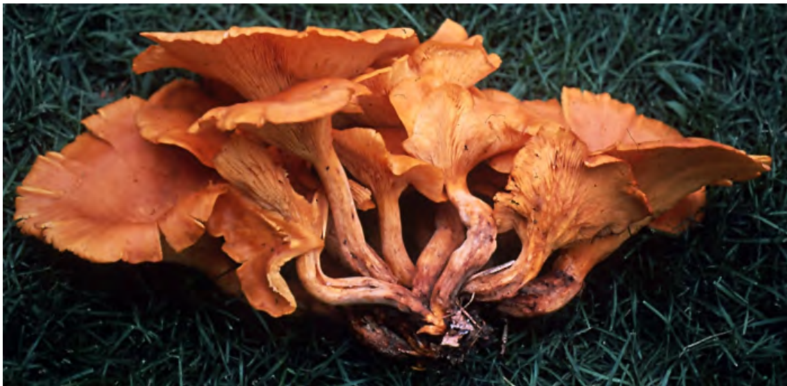
Fig. 11. Omphalotus illudens . Because the mushrooms grow from a common base arising in dead wood, this should never be mistaken for chanterelles (species of Cantharellus ) that grow separately (not from a common base) on the forest floor.

Clusters of fruiting bodies from one or a few common bases occur on old stumps. In contrast chanterelles with which Omphalotus species are sometimes confused (above) occur separated from one another and grow on the ground. The gills are always reported to be luminescent. RET has seen this only once after sitting with the mushroom in a closed closet in a dark room with a heavy blanket over the mushroom and the observer for 10 or 15 minutes.